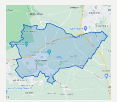
Corsham Town Centre